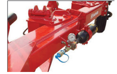
Hydraulic safety pressure adjustment