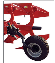
Depth control wheel